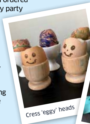
Cress 'eggy' heads