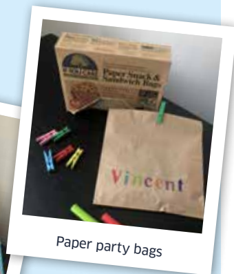
Paper party bags

Be aware, even if something is advertised as eco-friendly, you may find the items are individually wrapped in plastic. If you find this is the case, feedback to suppliers and try to buy in bulk where possible. Also, try to avoid anything containing glitter, which is a micro-plastic.